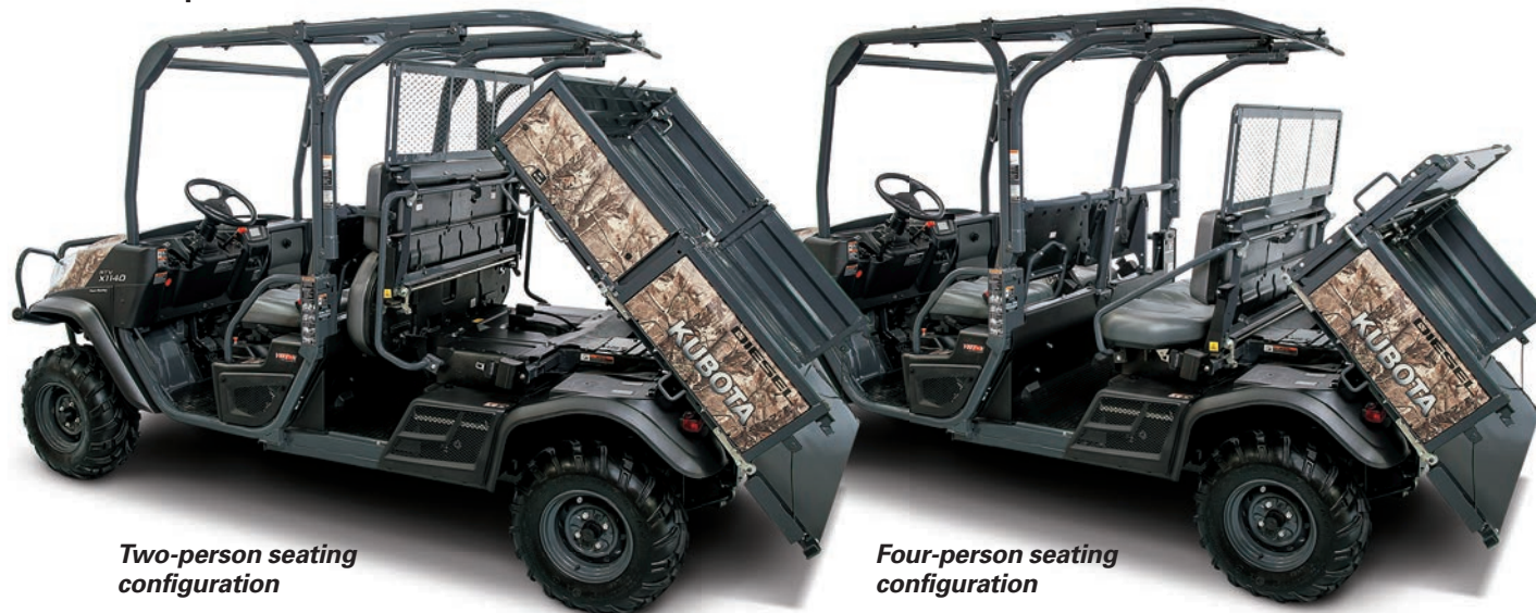
Two-person seating configuration

Move back and secure the protective screen with back rest. Finally, lower and secure the bench seat. Reverse these three steps to restore the RTV-X1140's full-length bed.